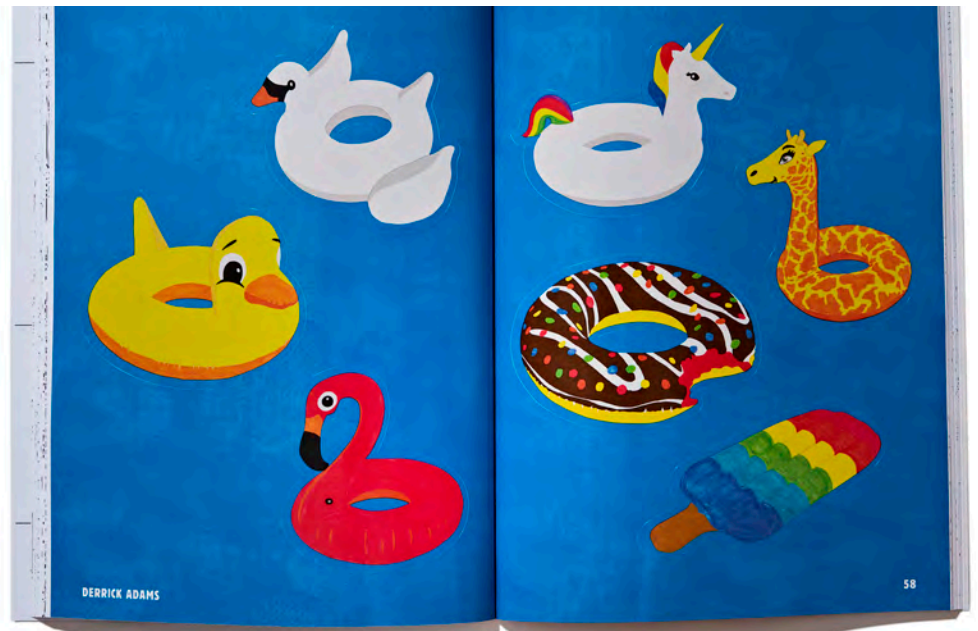
Derrick Adams, Volume 8 sticker spread.