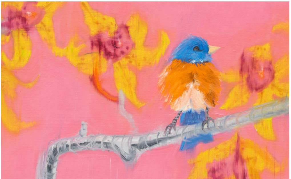
Ann Craven, Little Pink Horizontal Promise, Again, 2019