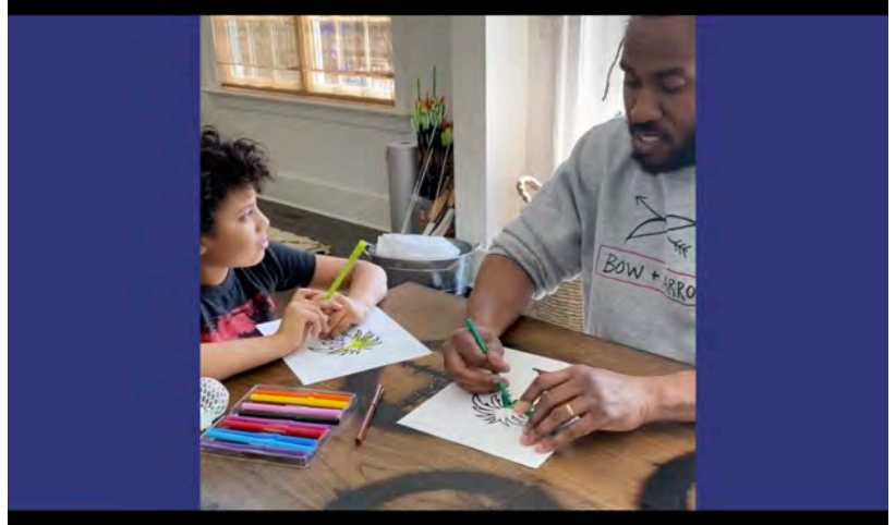
Still from Rashid Johnson's RxART #ColoringFromHome Video, 2020

Within days of Governor Andrew Cuomo's March 2020 PAUSE Order closing schools and nonessential businesses across New York State, the nonprofit RxArt—an organization that commissions art installations for pediatric medical settings—launched a series of daily online drawing sessions hosted by contemporary artists. Artists working with RxArt transform places fraught with anxiety into immersive, playful environments, among them a suite of inpatient rooms at Cedars-Sinai Medical Center in Los Angeles whose walls and ceiling Urs Fischer covered in whimsical designs, and the entrance lobby of the Children's National Hospital in Washington, D.C., that features a brightly colored monkey atop a 14-foot-tall beaded palm tree by the Haas Brothers. Since 2006, RxArt has also produced a series of coloring books (an eighth issue is forthcoming this fall) with contributions from artists. The books are distributed free to children's hospitals and to the families of kids undergoing treatment.