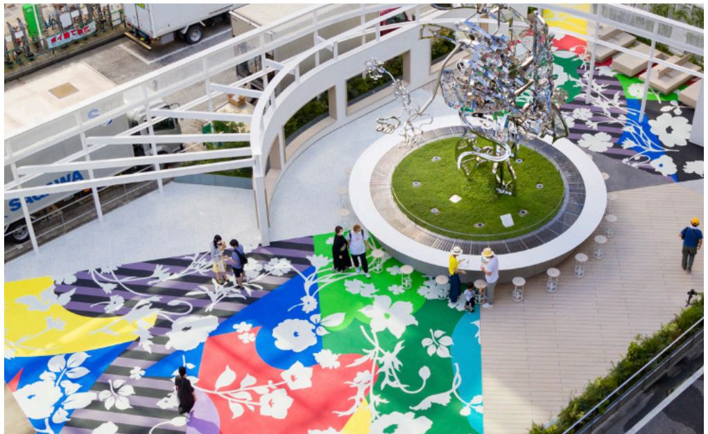
Tomokazu Matsuyama, Public Mural and Installation at JR SHINJUKU STATION EAST SQUARE, 2020