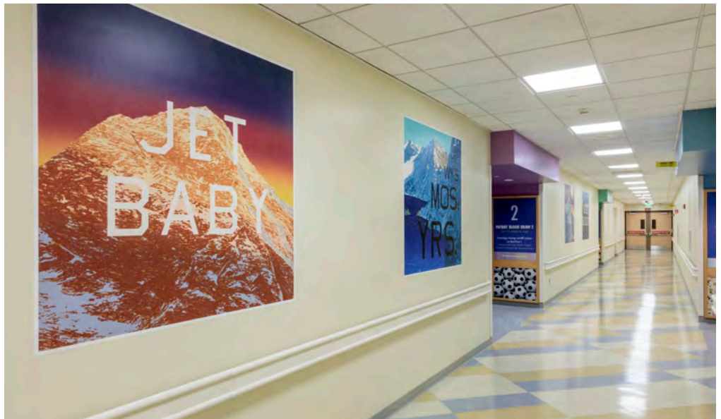
Ed Ruscha at Children's Hospital Los Angeles.

Advocate Illinois Masonic Medical Center, Chicago, IL, 2016