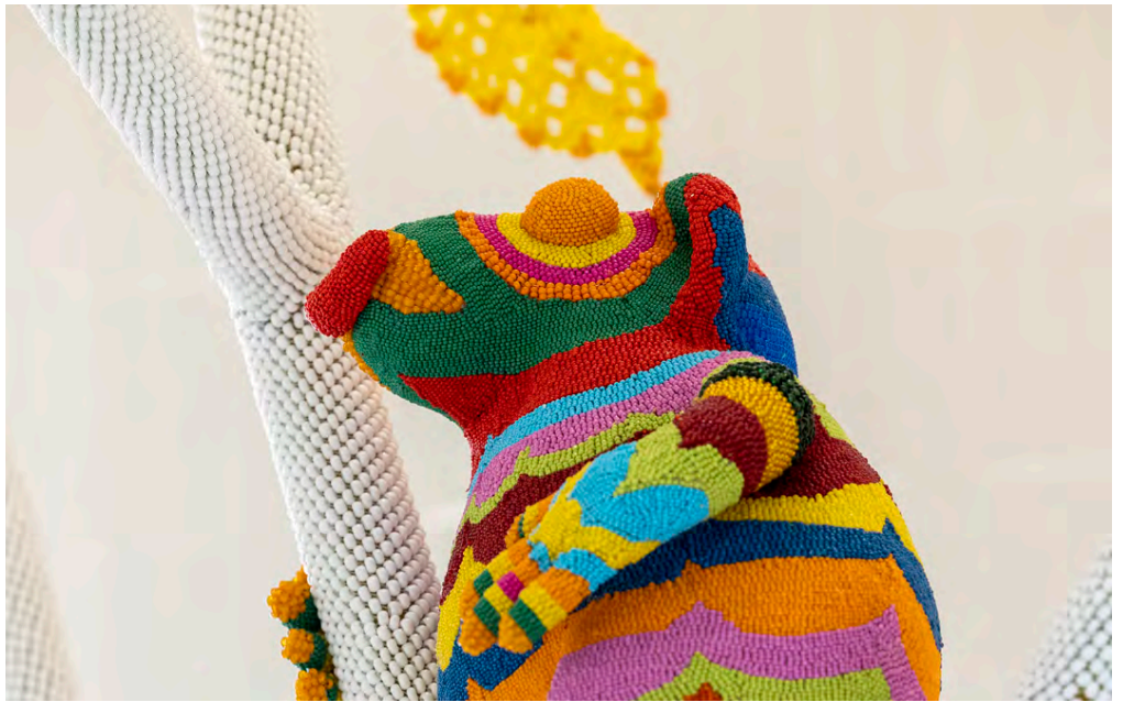
The Haas Brothers, Details of "Tree To Be Me," 2022 Installation