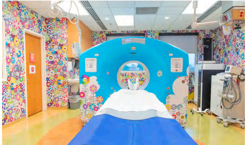
© Takashi Murakami / Kaikai Kiki Co., Ltd. All Rights Reserved