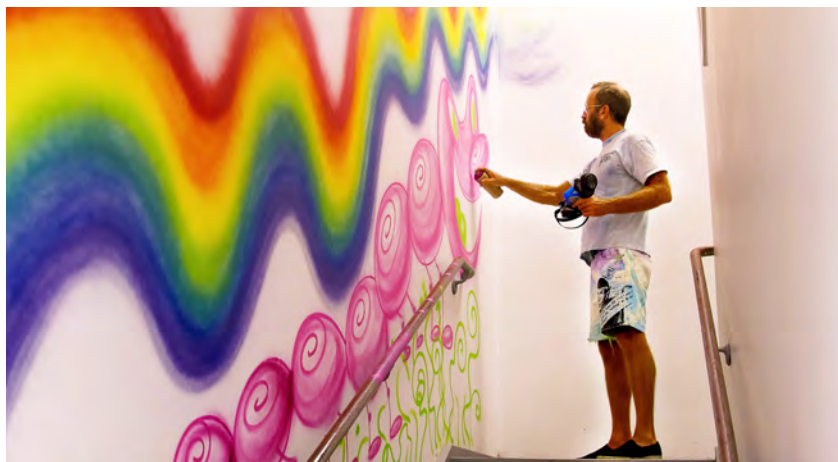
Kenny Scharf installing his mural at Kings County Hospital

St. Jude Children's Research Hospital Memphis, TN, 2008