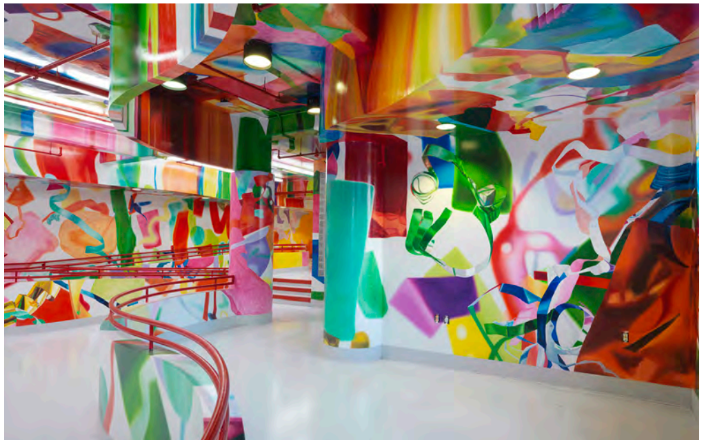
Dan Colen Installation at St. Mary's Healthcare System for Children