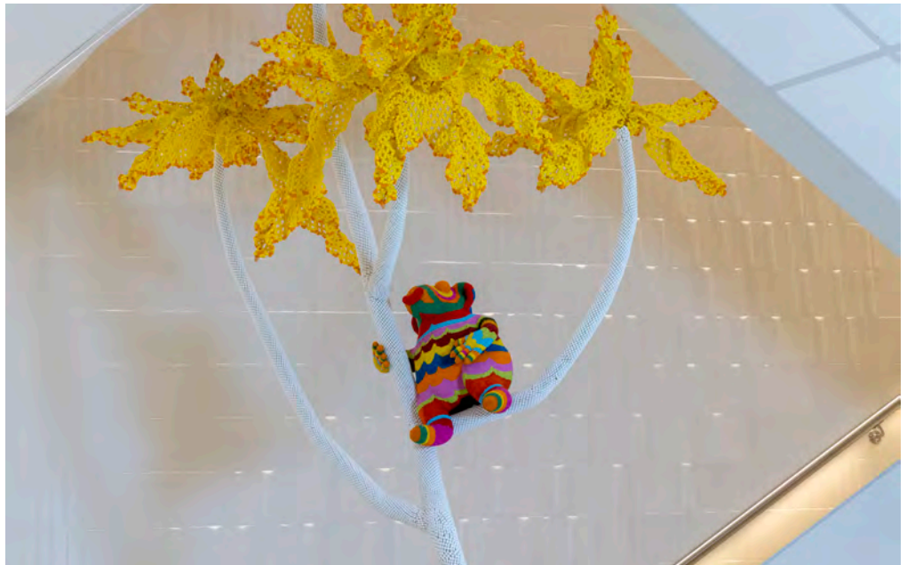
The Haas Brothers, Detail of sculpture, "Tree to Be Me," 2022, installed at Children's National Hospital.