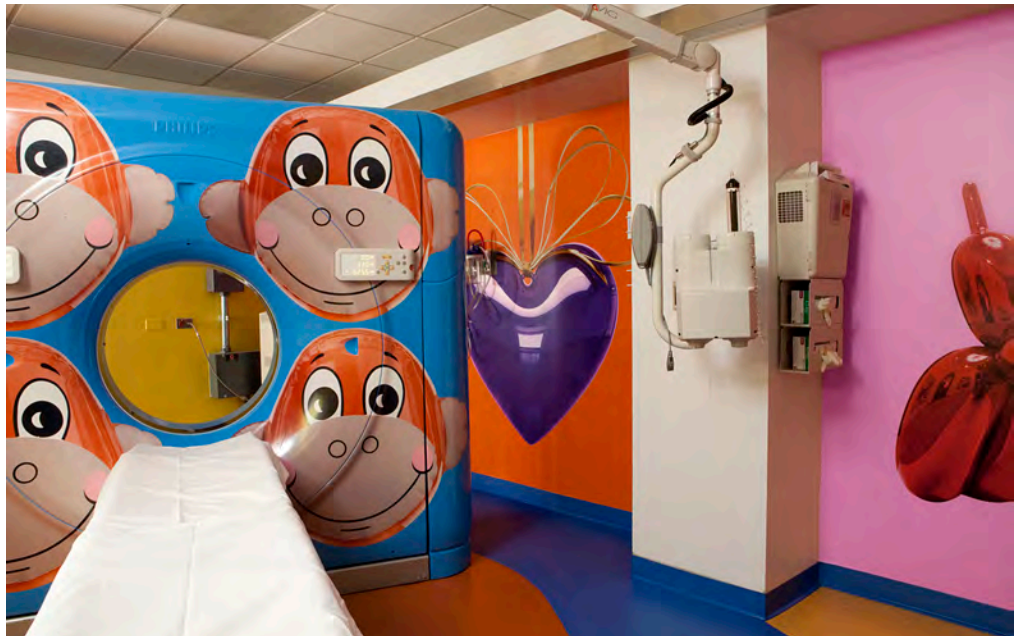
Jeff Koons Installation at Advocate Children's Hospital