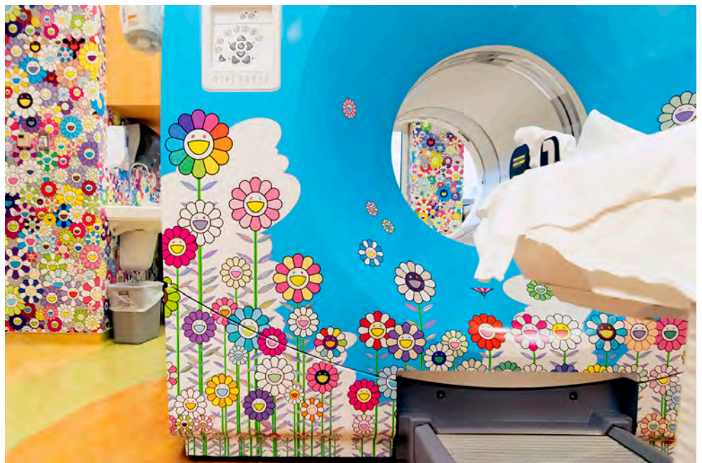
CT/PET Scan Suite at Children's National Hospital in Washington, DC.

Children's National Hospital Pediatric Intensive Care Unit Washington, DC, 2020