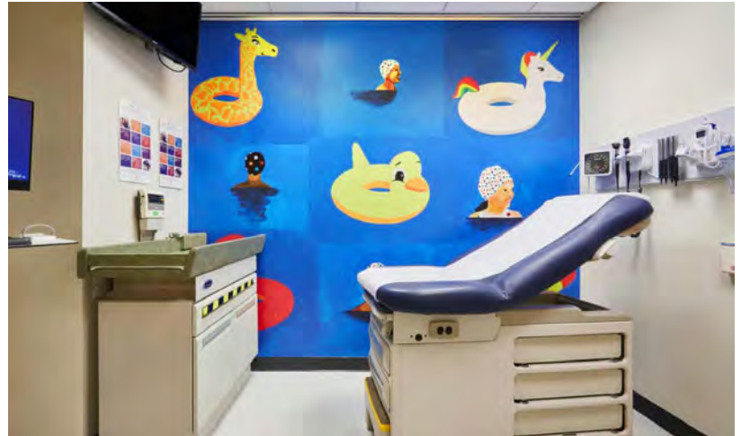
Derrick Adams Installation at NYC Health + Hospitals/Harlem, 2020.

The power of art in connection to wellness has been chronicled for decades with countless studies showing that any sort of creative expression can help maintain immune systems while elevating moods, reducing stress and blood pressure. Not-for-profit system of hospitals Intermountain Healthcare goes one step further, positing that the relationship between the fields runs even deeper, claiming that "research shows that patients who are exposed to art during a hospital stay actually heal quicker and have a better overall experience."