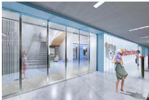
Rendering of new lobby entrance to hospital

RxART is honored to have worked with The Haas Brothers on a project for Children's National Hospital in Washington, DC. The Haas Brothers created a large, vibrantly colored sculpture that welcomes visitors into the hospital's newly renovated entrance. The nearly 220,000 patients cared for each year at Children's National are now greeted by The Haas Brothers' 14-foot marble and beaded palm tree and its multi-colored resident monkey. The monkey hanging from the sculpture was beaded by the Haas Sisters in Cape Town, South Africa and the intricate leaves of the tree was created by the Haas Sisters of Lost Hills in California's Central Valley. The Haas Brothers' project is RxART's fourth installation at the hospital and the organization's first sculpture project. Children's National has been designated three times in a row as a Magnet® hospital, demonstrating the highest standards of nursing and patient care delivery.