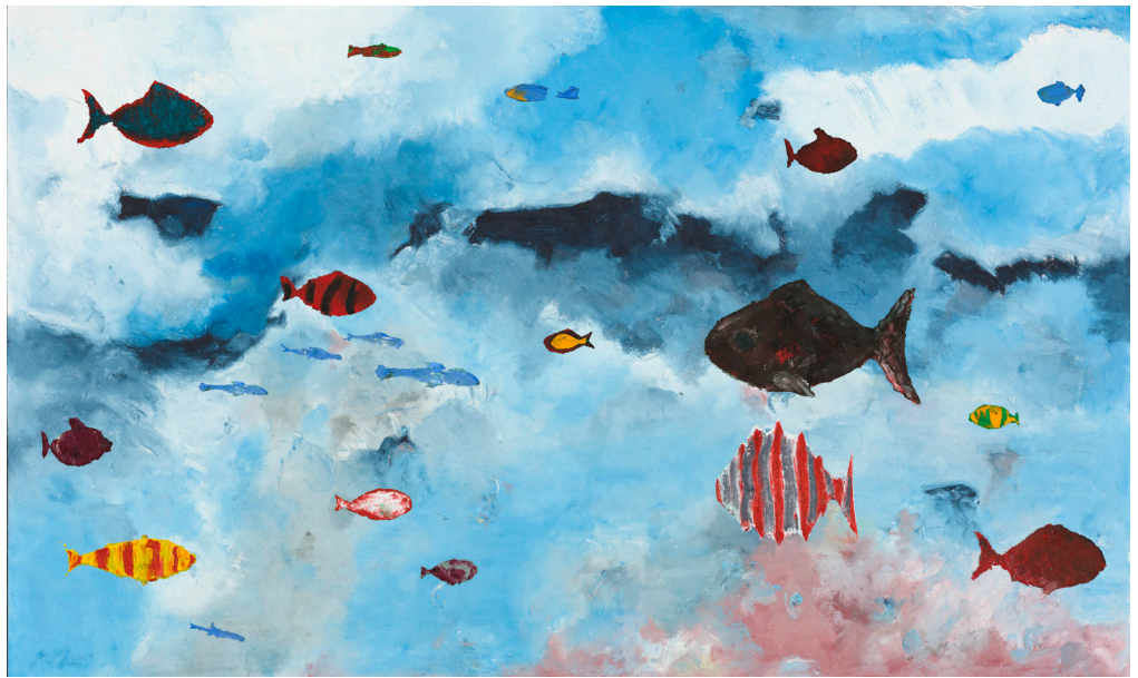
Harold Ancart, Proposal detail for project