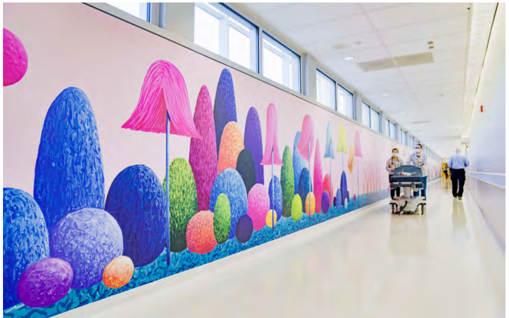
Nicolas Party, "Trees for Children". Installed at Children's Hospital Los Angeles.