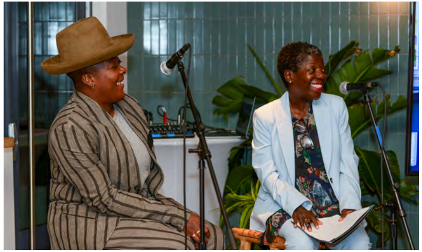
Nina Chanel Abney and Thelma Golden.